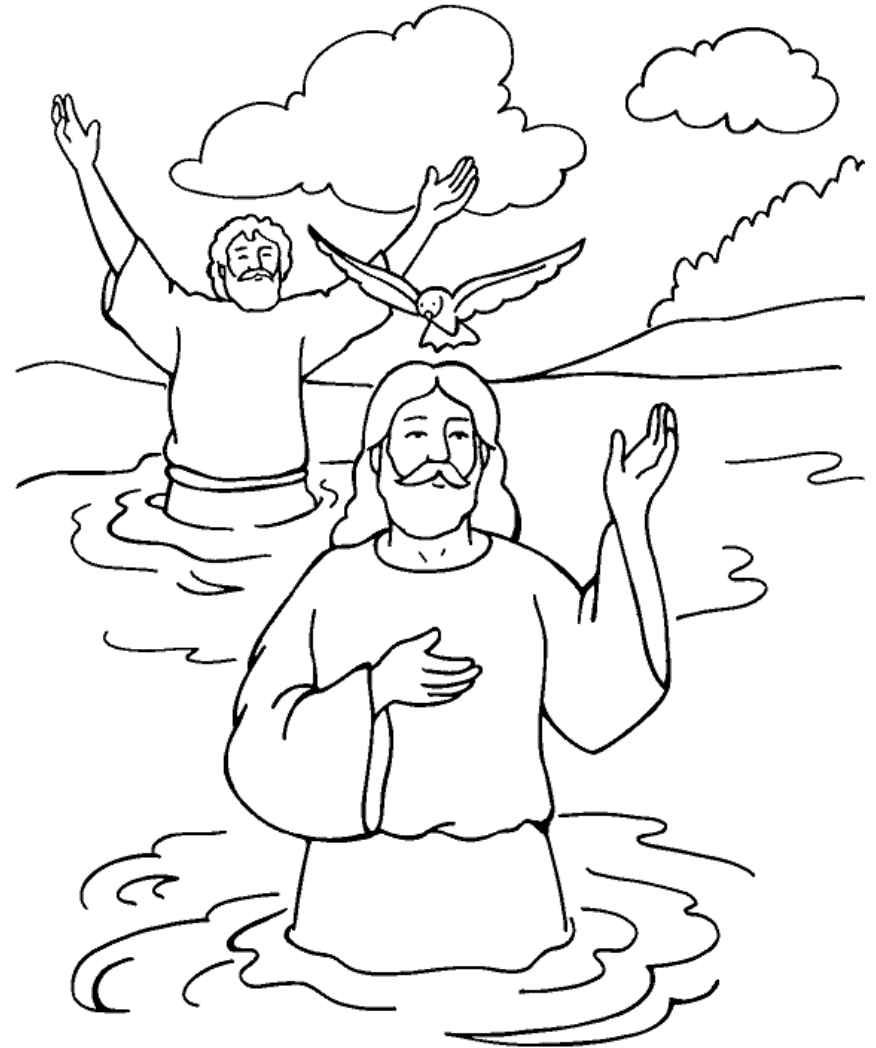
John Baptizes Jesus