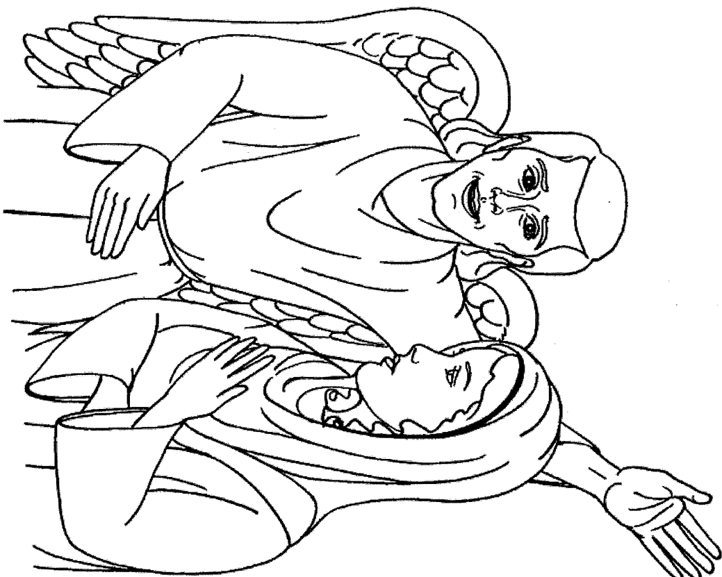
The Angel Gabriel Appears to Mary Luke 1:26-38