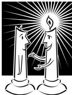
Jesus Is the Light