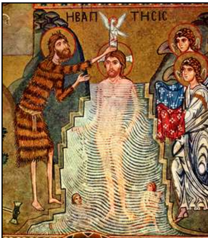
Image: Baptism of Christ , Cappella Palatina di Palermo, mid 12th century, from Art in the Christian Tradition , a project of the Vanderbilt Divinity Library, Nashville, TN.

January 7, 2024 10:15 am Worship Service