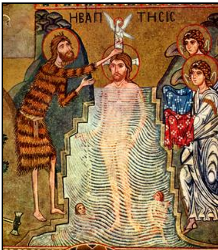
Image: Baptism of Christ, Cappella Palatina di Palermo, mid 12th century

January 12, 2025 10:15 am Worship Service